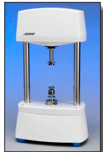
ElectroForce® 3100 Test Instrument

Manufacturers and regulatory agencies can monitor the different fast dissolve/disintegration technologies of ODTs using the ElectroForce® 3100 test instrument. The 3100 test instrument is a tabletop system designed for low force applications that require greater control resolution than typically available with moderate to high force test instruments. The goal of these tests was to simulate dissolving ODTs in the mouth. The tests monitored the disintegration of four different brands of ODTs under controlled conditions via force and displacement as a function of time.