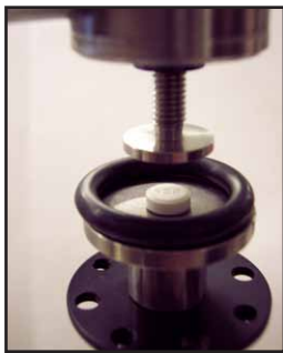
ODT mounted onto test platen before loading.

Four different brands of ODTs were tested on the ElectroForce 3100 test instrument equipped with a 250 g load cell. Two brands, each manufactured with a different fast dissolve/disintegration technology, had an average disintegration time ranging from 1 to 20 seconds. The other two brands were also manufactured with different dissolve/disintegration technologies and had an average disintegration time ranging from 120 to 225 seconds. Force and displacement data as a function of time was recorded for each of the four ODTs tested.