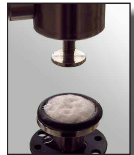
ODT after test is complete.

As the water reacted with the tablet and the tablet disintegrated, the Bose linear motor maintained a load of approximately 10 mN on the remainder of the tablet. Once the tablet was mostly or wholly dissolved, the test was manually stopped.